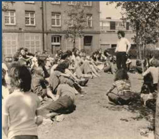
Student volunteers at Oxford House in the 1970s.

The College established Oxford House in Bethnal Green in 1884 as a high-Anglican Church of England settlement. Links with the College remain strong. It is now home to many enterprise groups who provide a range of programmes for the community with the aim to meet the needs of local people, and enable them to fulfil their potential. For more details: www.oxfordhouse.org.uk or www.keble.ox.ac.uk