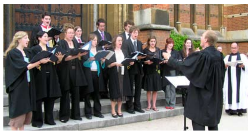
△ The Choir sang their annual open air evensong in early June.