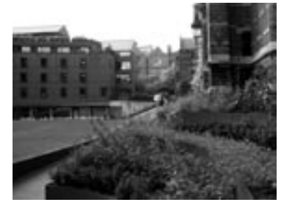
△ The start of the new planting in Newman Quad