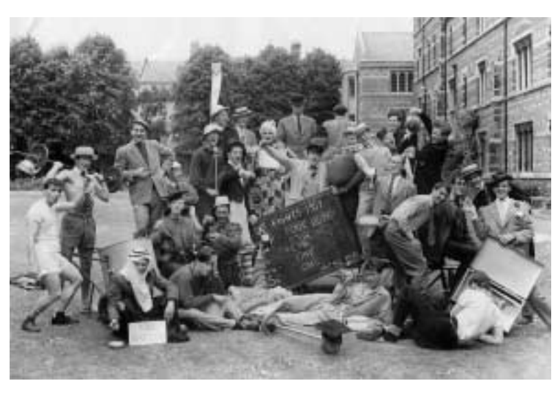
Both prize-winners will win a dinner for two at High Table.

In this form, the competition will only be of relevance to a comparatively small group of our Old Members. So, a second prize will be awarded to the person who comes up with the best caption for the photograph.