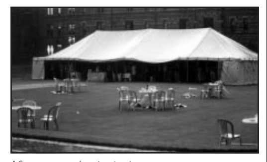
After — strawberries in the marquee.

The traditional Eights Week Garden Party was this year interrupted by a violent thunderstorm. Lightning struck the College, knocking out half the computers and phones and smashing a hole in the Hall roof. The party continued in the marquee.