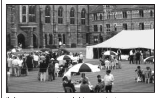
Before — tea and sandwiches on the lawn

The traditional Eights Week Garden Party was this year interrupted by a violent thunderstorm. Lightning struck the College, knocking out half the computers and phones and smashing a hole in the Hall roof. The party continued in the marquee.