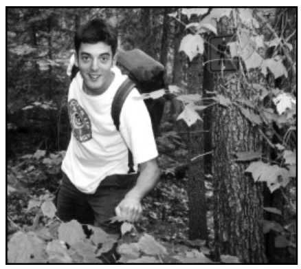
Our intrepid Earthwatcher

To a new-comer the sprawling pine forest appears untouched, but only 1% of its original cover remains in the Temagami region. Serious conflicts exist between the burgeoning conservationist movement and the traditional industries, logging and mining. The value of old growth forests goes beyond their logging potential; threatened species include bears, moose and the towering red pines, but these only hint at the