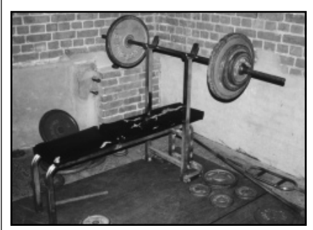
Instruments of torture?

Come, if you dare, to a place known only to the initiated.