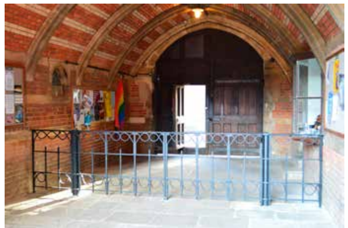
New wrought-iron security gates to the Lodge archway