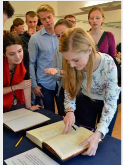
Freshers signing the Register