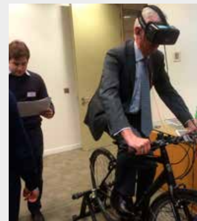
The Warden trying out the virtual reality exercise bike