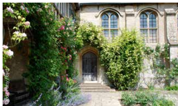
The loggia where the housekeeper consoled Cromwell on the loss of his wife and daughters