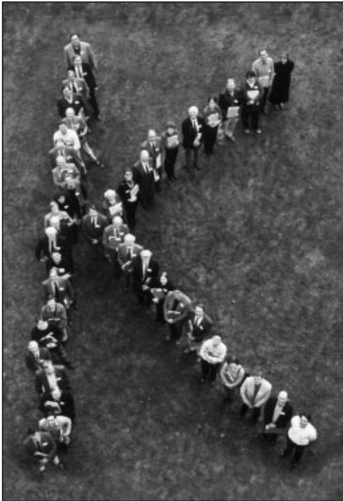
'Straighten up at the back!' The year group organizers at Keble for the Conference.