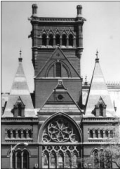
Looks familiar? Harvard's Tanner Memorial Hall, opened in the same year (1878) as Keble Hall. If only our endowments were as similar as our buildings!

In the 15 or so years since I left Keble, I've received just a handful of fundraising requests. Since I left Harvard 10 years ago, I've received so many that they have their own filing cabinet. Facts like these help to explain why Harvard University, with a gross endowment of over $11bn (£6.6bn) has an endowment per student of over $600,000 (£366,000) – well over ten times the figure for Keble. Last year alone, the Harvard endowment fund distributed some $500mn to the university departments, accounting for 30% of the university's total income.