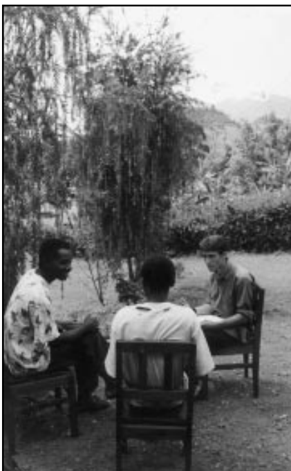
Interviewing coffee farmers on Mount Meru