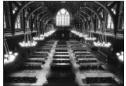
The interior of Harvard's Memorial Hall. Originally built as a memorial to Harvard's Civil War casualties, this was recently renovated by a gift from the foundation established by Walter Annenberg – former Ambassador to the UK.

The parallels with the American experience are clear. Keble now is faced