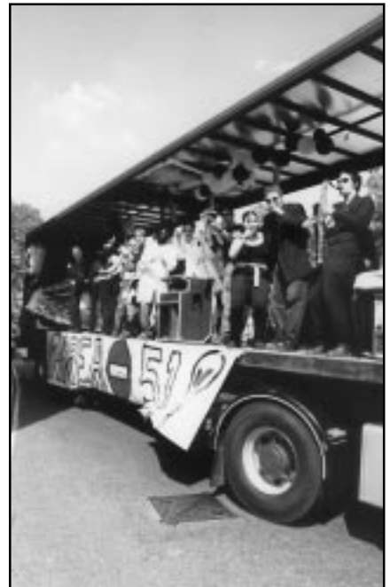
Inter-planetary bounty hunters, dancing space sirens, madcap scientists – the Keble float in the 1998 Rag Parade won the competition to collect the most money for charity with its frenetic display of interstellar lunacy.