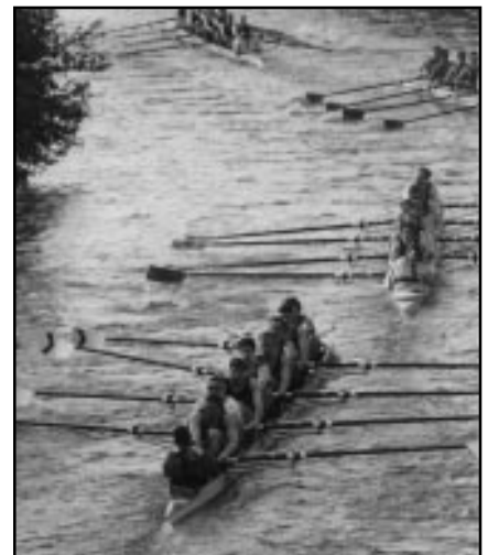
The bump that wasn't – Keble close Balliol at the Gut on Day 2

Summer Eights brought mixed fortunes for the Boat Club. The men's 1st VIII, stroked by Olympic gold-medallist Jurgen Hecht, looked promising in qualifying, and were in confident move after bumping Christ Church on the first day. But a bump on Balliol on Thursday was disallowed, and on Friday, within a canvas of catching Balliol again, a caught crab stalled the boat and Jesus came through. A Saturday row-over left the crew back where it had started the week. Other crews experienced similar triumphs and disasters. The exception was the 'Jazz Crew', which narrowly missed blades.